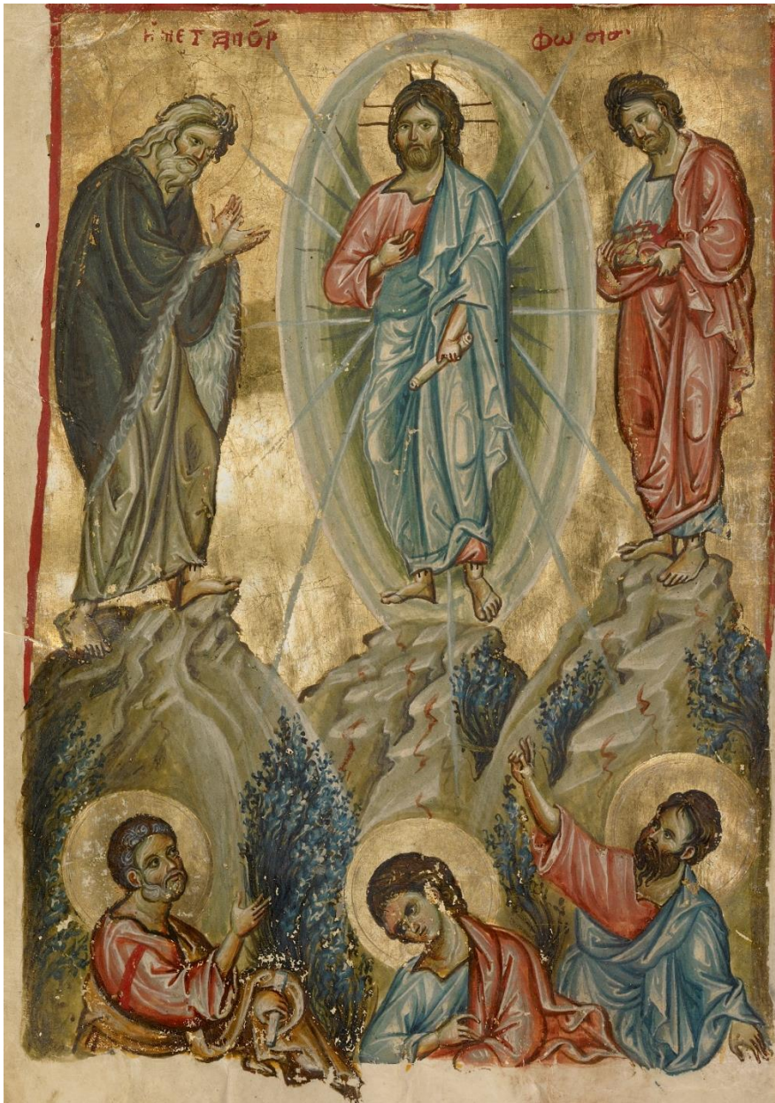
The Transfiguration , Gospel Book, Byzantine, early-late 13 th century J. Paul Getty Museum