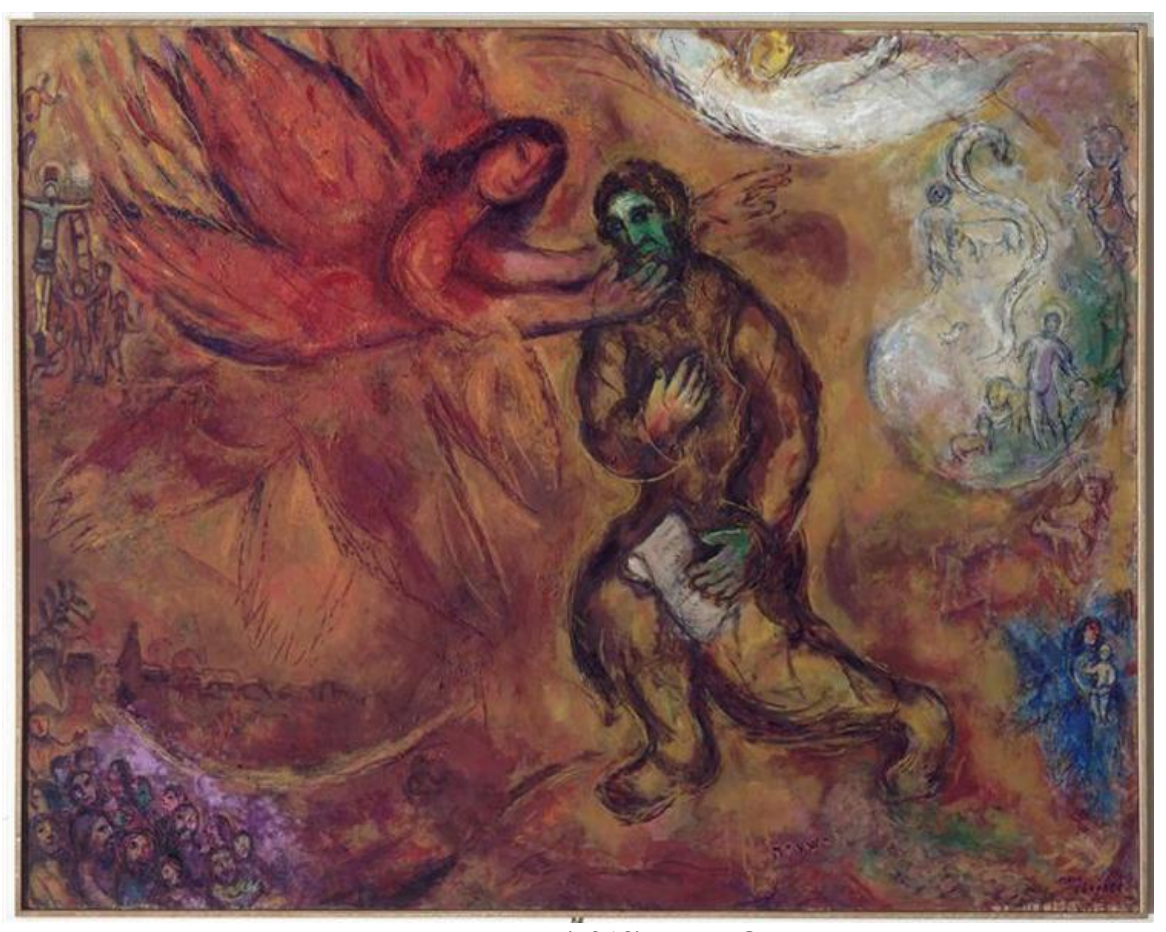
The Prophet Isaiah (1968), Marc Chagall