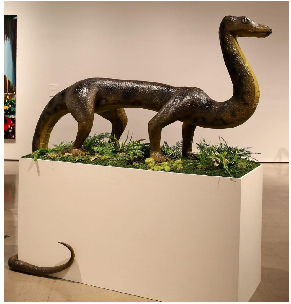
"The Serpent Before the Fall" (2014), Mark Dion