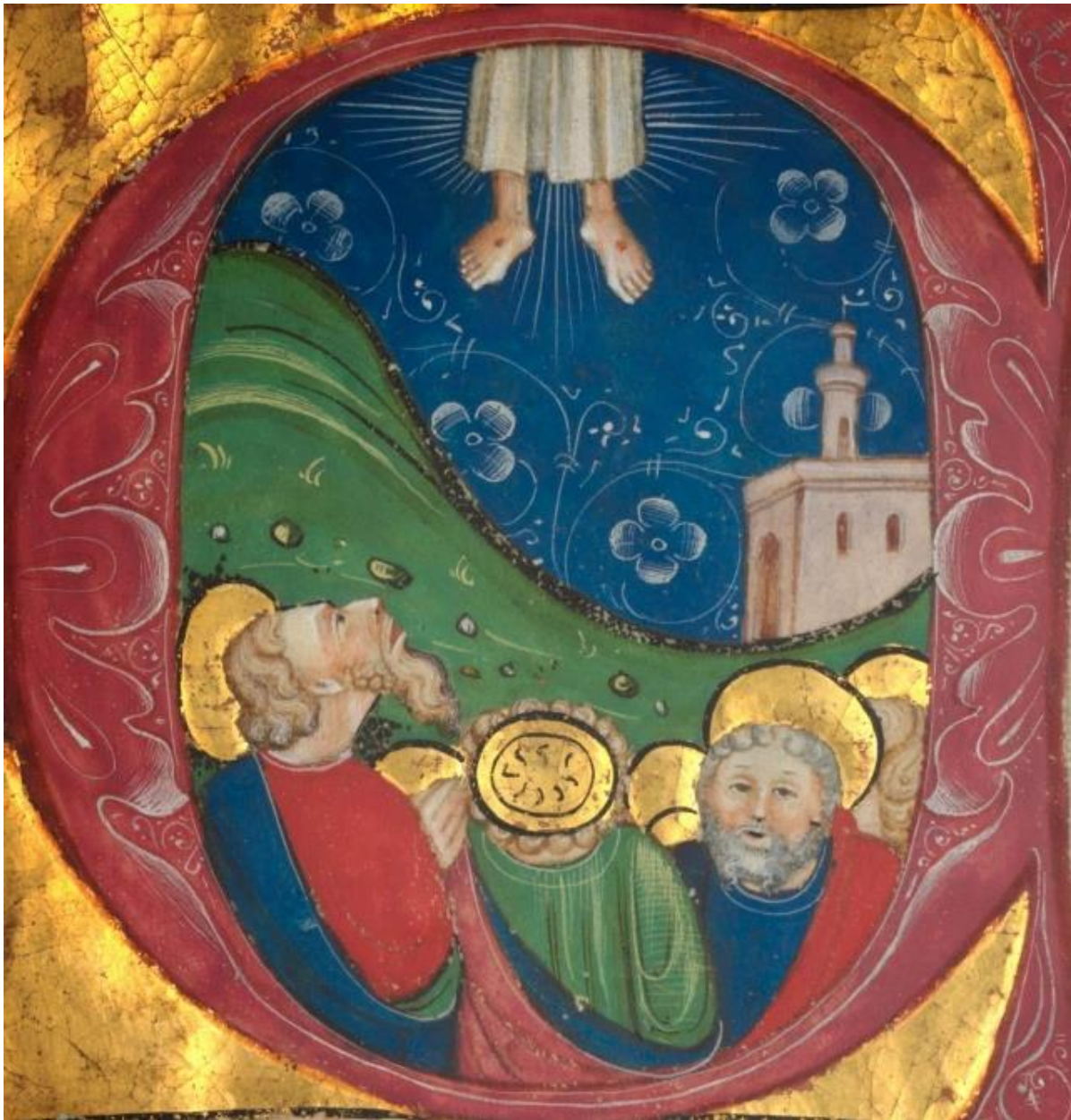
Italy, 15th Century