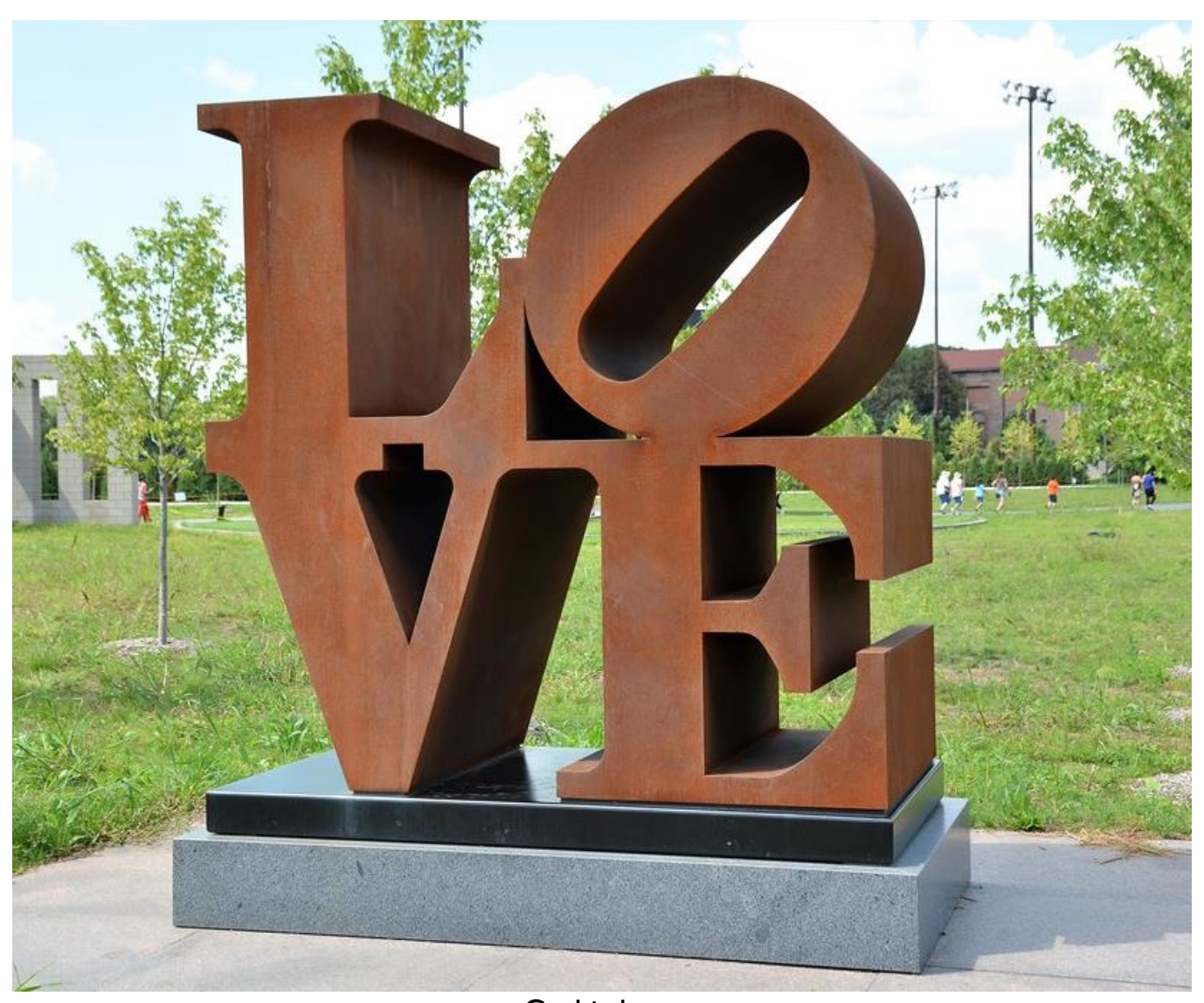
God is love. (1 John 4:16b)