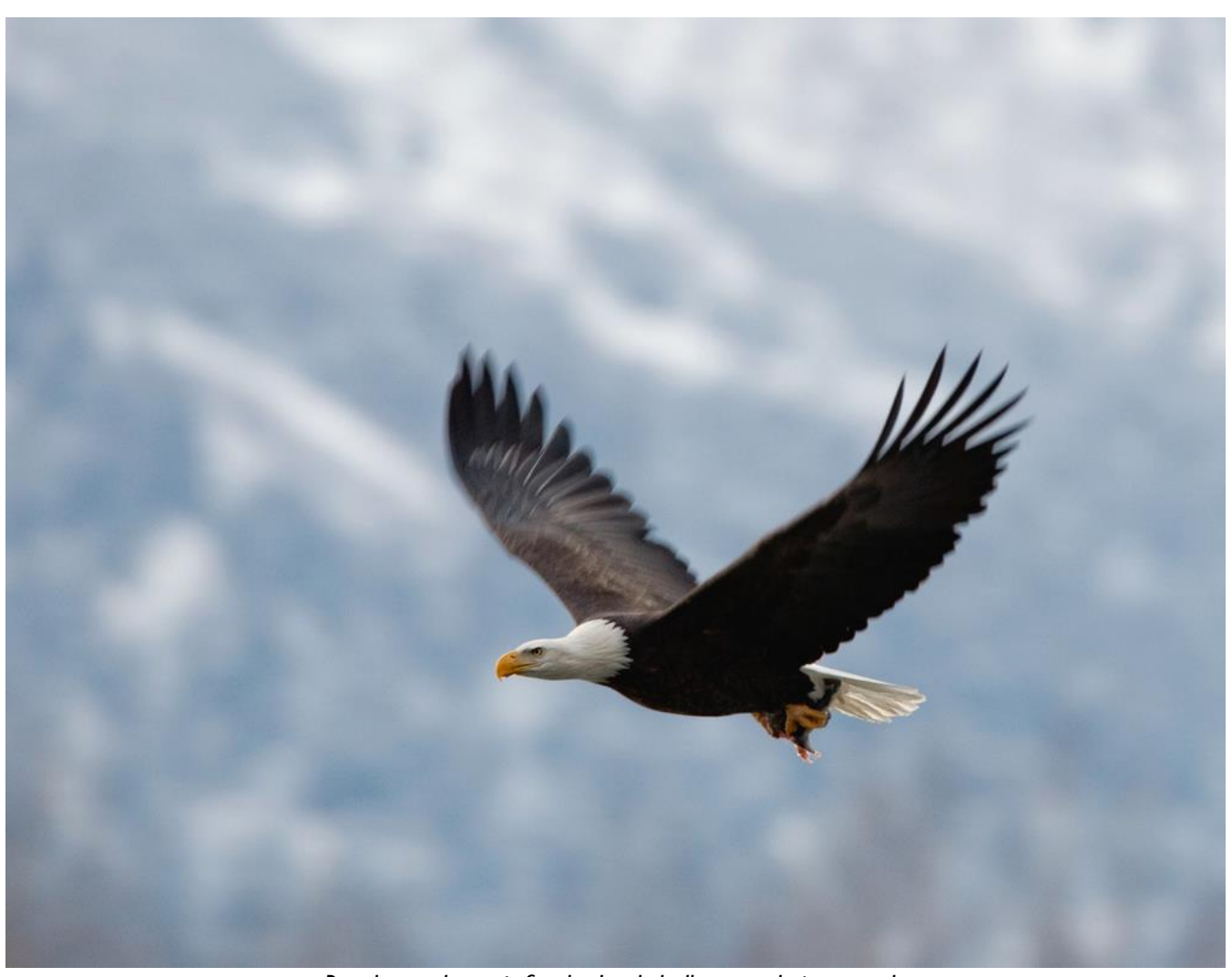
But those who wait for the Lord shall renew their strength, they shall mount up with wings like eagles, they shall run and not be weary, they shall walk and not faint.