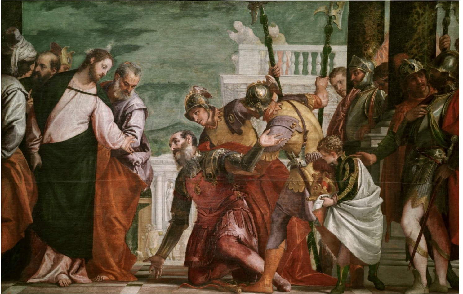
Christ and the Centurion (ca. 1571), Paolo Veronese, Museo del Prado