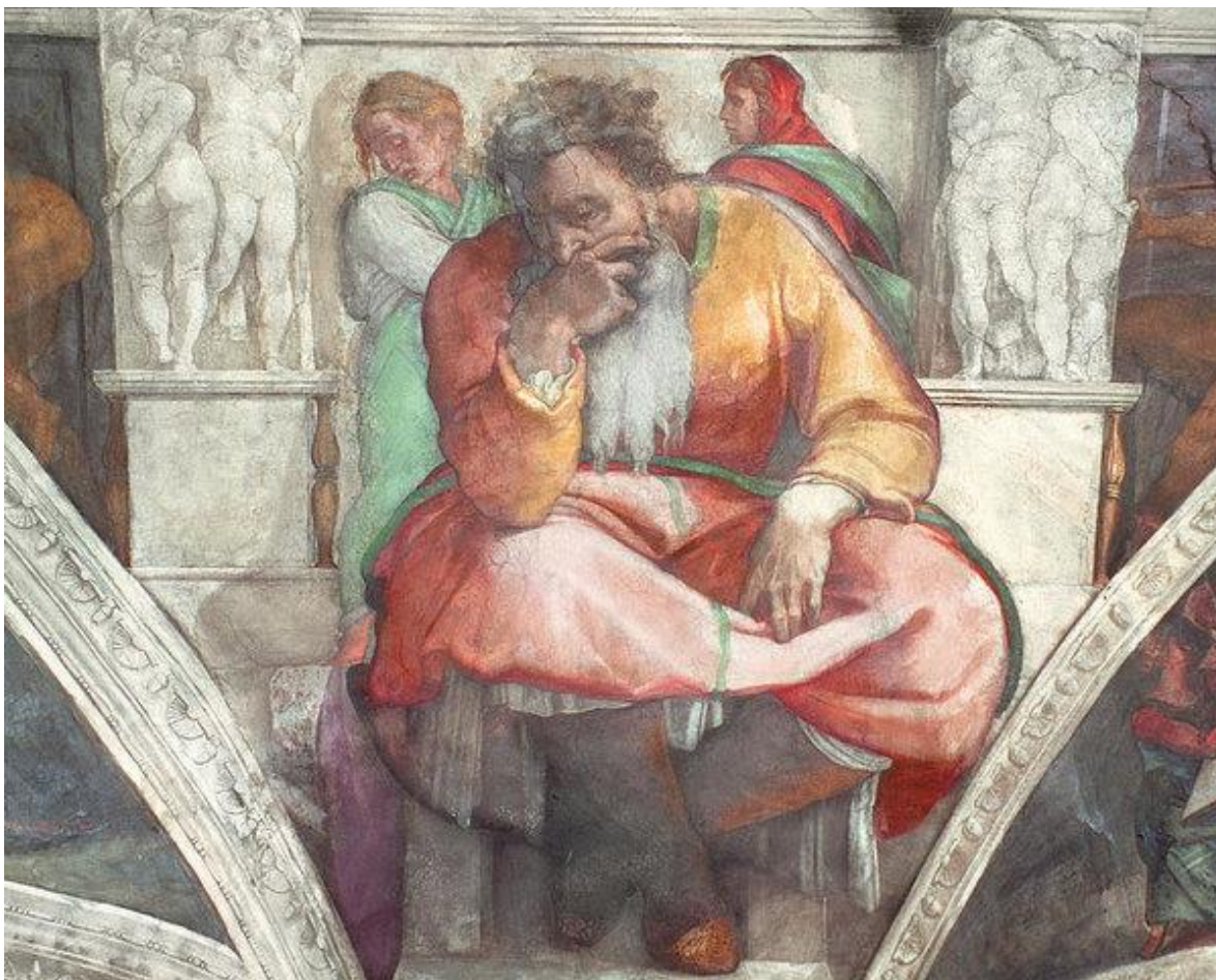
"Jeremiah" by Michelangelo Sistine Chapel, The Vatican